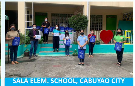
SALA ELEM. SCHOOL, CABUYAO CITY

With this, Laguna Water decided to support the heroic efforts of public-school teachers through its annual gift-giving activity, Daloy ng Saya. Seven schools from the cities of Santa Rosa, Biñan, Cabuyao, and the municipalities of Pagsanjan, Pakil, and Victoria were selected. The schools each received 90 reams of bond papers and 20 units of printer inks as support for their module production.