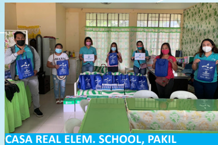
CASA REAL ELEM. SCHOOL, PAKIL

The education sector has been hard-hit by the effects of the pandemic. When the schools closed in 2020, millions of learners, parents, and teachers were affected. The sudden shift to distance learning highlighted the need for new and creative ways to encourage children to continue their studies.