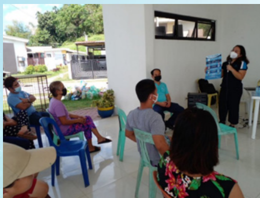
Residents of BellaVita Alaminos joined in the celebration of the 2022 World Oral Health Day last March.

Following the online celebration, Laguna Water and MWF also donated toilet cleaning products to the Laguna Medical Center in Sta. Cruz, Laguna for their daily operations. The items donated from Philusa Corporation were very timely, especially with the heightened need to consistently keep facilities sanitized.