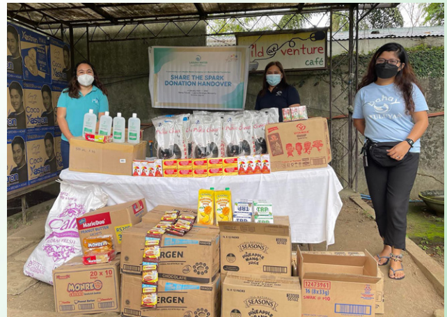
Bahay Tuluyan - Laguna, a non-profit organization that caters to the needs of vulnerable children, received the in-kind donations purchased from the proceeds of the Share the Spark Donation Drive.