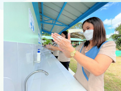
Teachers from Limao Elementary School, Calauan actively participated in the Global Handwashing Day celebration.

Laguna Water has also been instrumental in equipping schools and communities to curb the spread of the virus. As the world transitions to a new way of living, the Company and Manila Water Foundation (MWF) provided hand hygiene facilities in two locations. The handwashing facilities are designed to prevent the spread of the virus, wherein the faucets can be operated using a foot pedal or an elbow lever. The handwashing stations were also properly distanced to comply with the government's existing health protocols. The facilities were also installed with guides to nudge users to practice proper handwashing, while hygiene products were also distributed to the users.