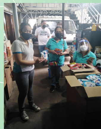
Distribution of hygiene kits to San Isidro Elementary School, Pagsanjan, Laguna.

The hygiene products benefitted five schools in the province, including Caesar Z. Lanuza and San Isidro Elementary Schools in Pagsanjan, Malaban and Platero Elementary Schools in Biñan, and Dila Elementary School in Santa Rosa.