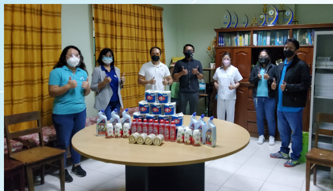
Laguna Water turned over toilet cleaning products to the Laguna Medical Center. The handover was also attended by officers from the Laguna Provincial Health Office.